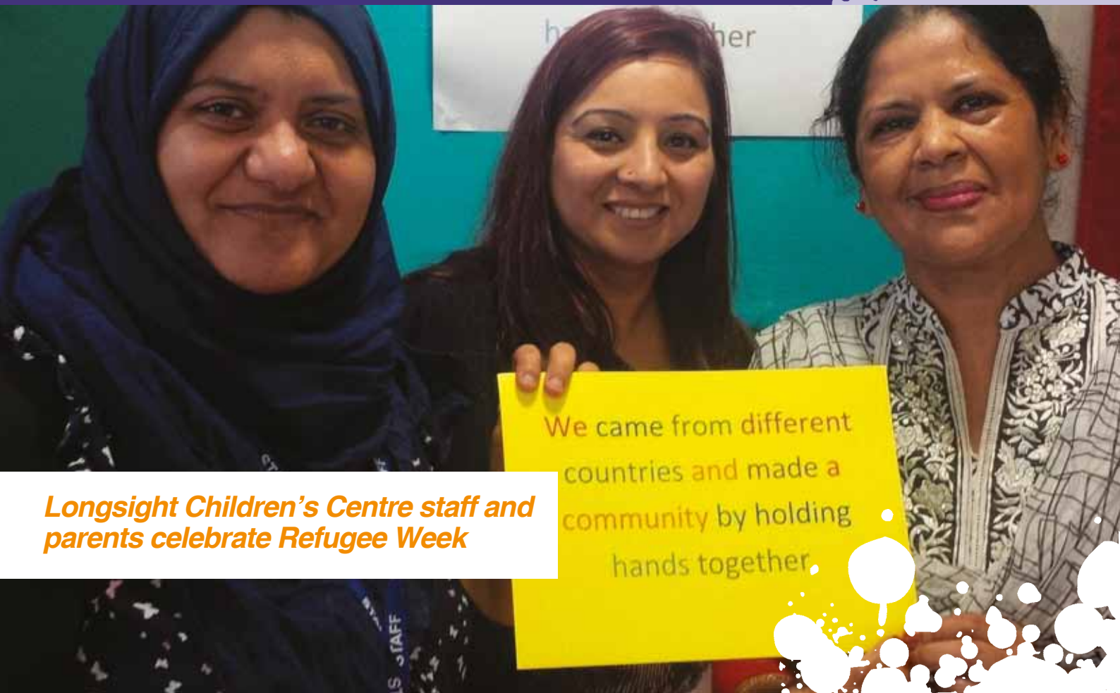
Longsight Children's Centre staff and parents celebrate Refugee Week

Over 4,326 families accessed our centres or used our services.