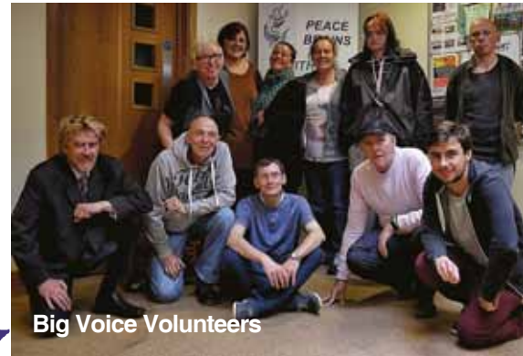
Big Voice Volunteers

“Going out and doing the surveys with people has got me out and about, and I’ve been offered paid work in one of the services. Big Voice has given me the insight and knowledge I needed and has definitely played a major role in me getting work. I’ve finally been given a second chance.”