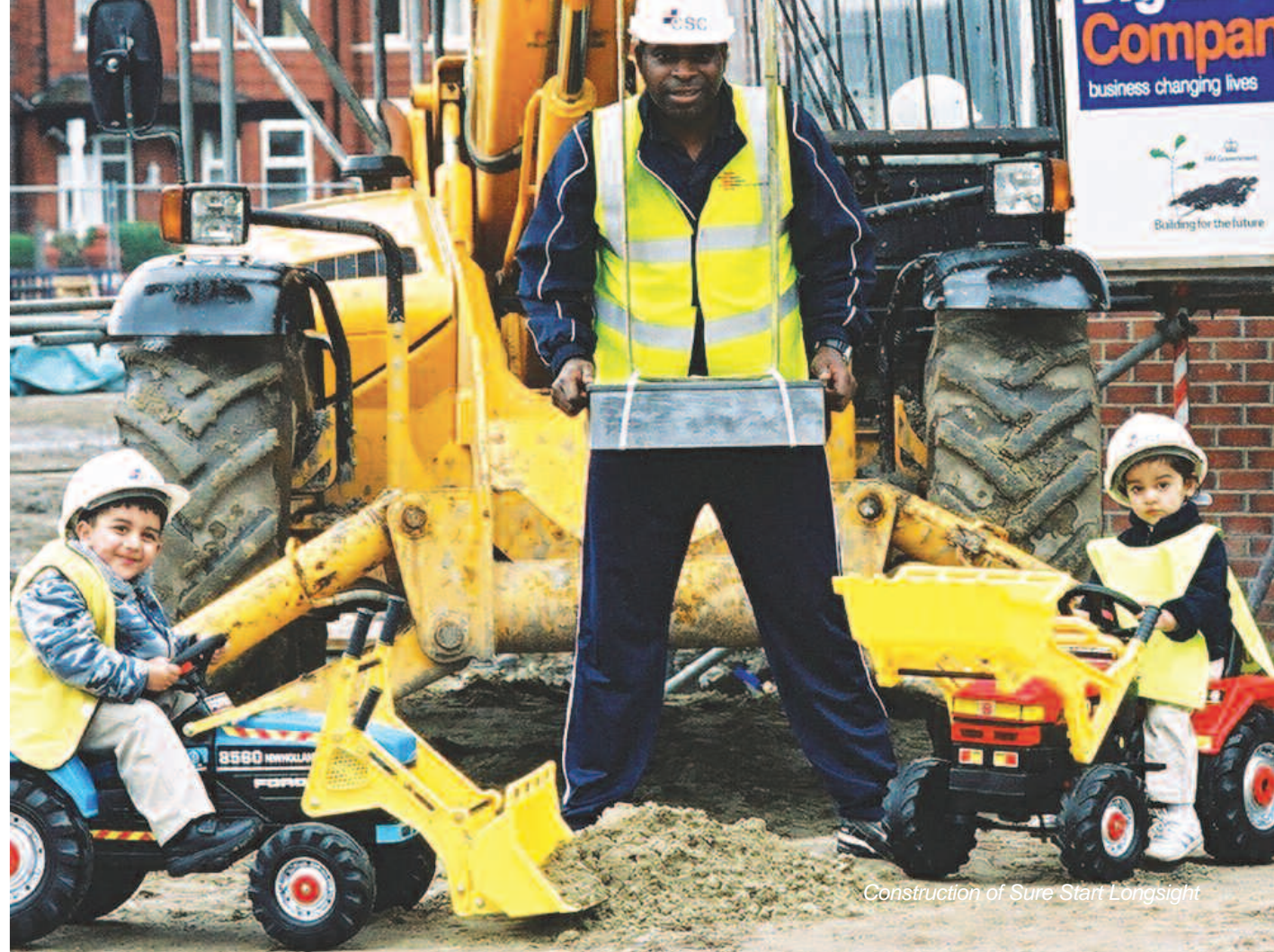
Construction of Sure Start Longsight

We learnt from this the importance of having a plan B and moved on to build our lovely, purpose built centre on the demolished site!