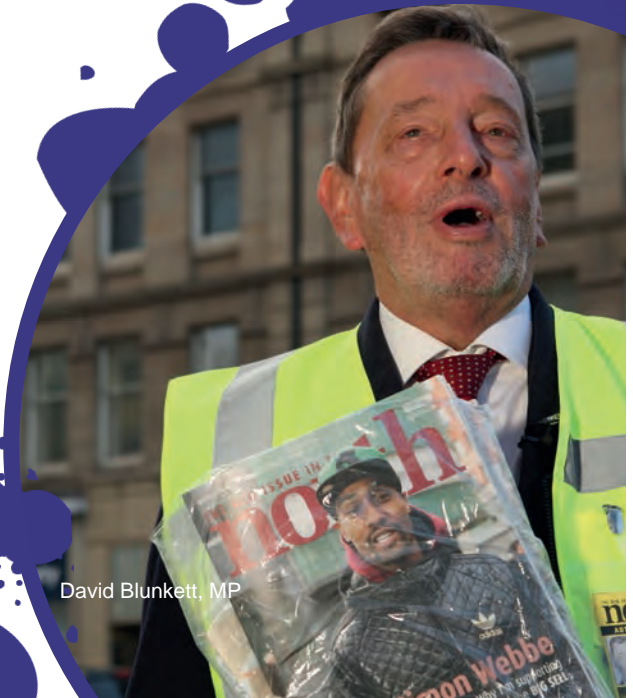
David Blunkett, MP