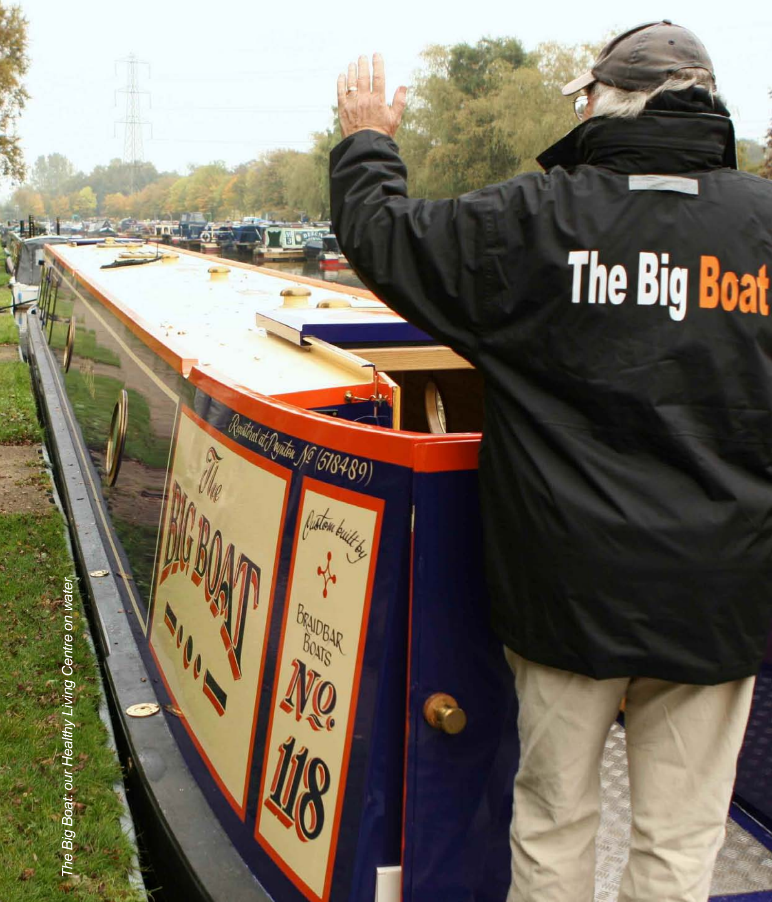
The Big Boat: our Healthy Living Centre on water