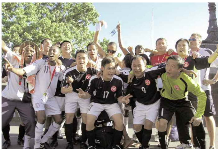
The England Team celebrate with the Hong Kong Team

England’s Homeless World Cup Team did their country proud at the international Homeless World Cup street soccer tournament in Melbourne, Australia, last December. The team finished an impressive eighth out of forty-eight countries taking part in the event. Work is already underway to find the team for the 2009 event which is in Milan, Italy. Regional trials are currently being held across the country with hundreds of people expected to try out to be part of the the team. Visit www.homelessworldcup.org for more.